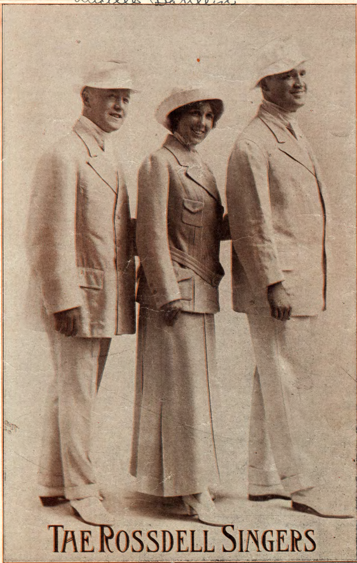
THE ROSSDELL SINGERS