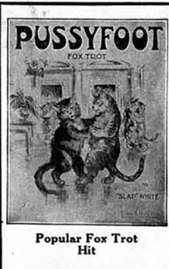
Popular Fox Trot Hit

Complete Copies on Sale Wherever Music is Sold!