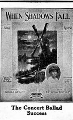
The Concert Ballad Success