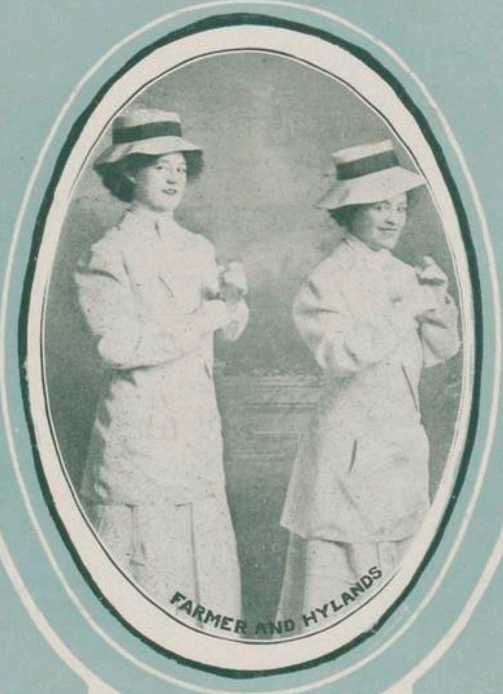
FARMER AND HYLANDS