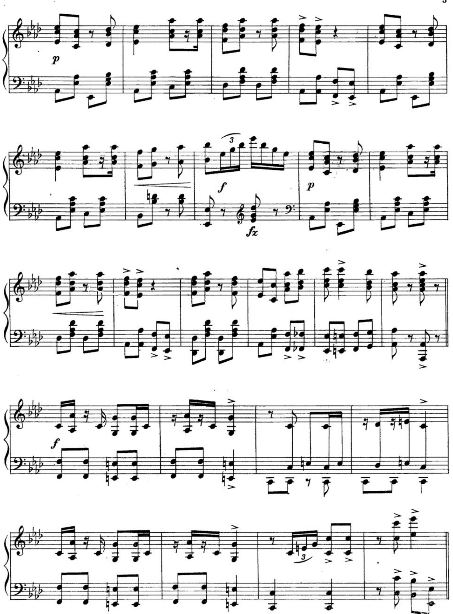
Pickles and P. - 5