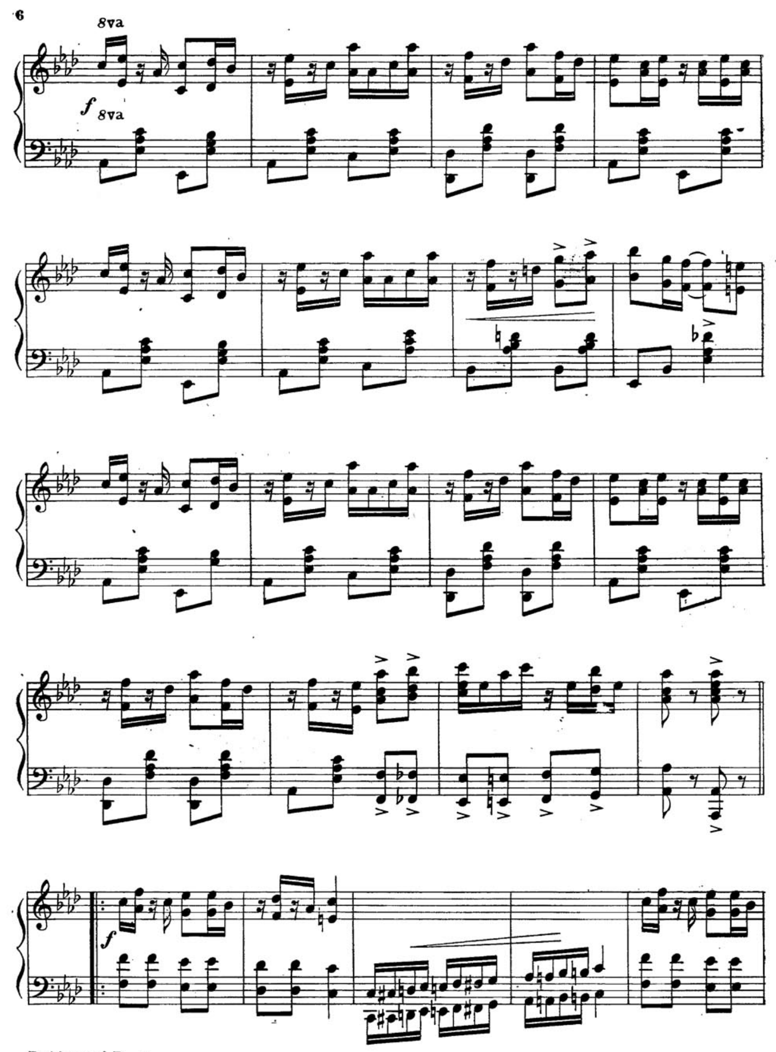
Pickles and P. - 5