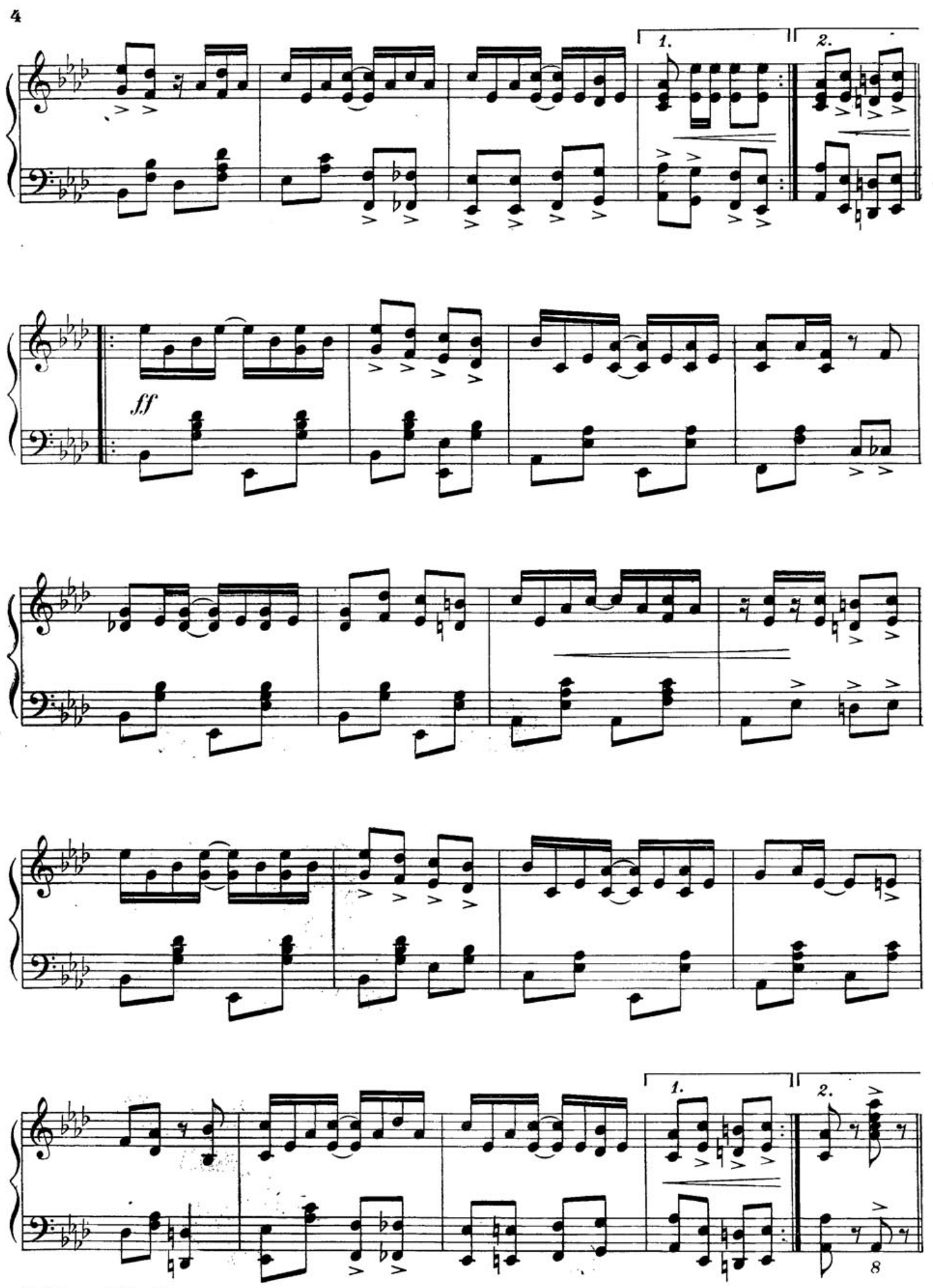
Pickles and P. - 5