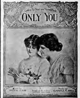
Waltz Song Hit