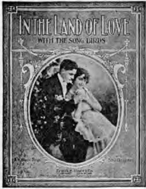
With Bird Obligato