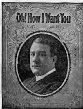
Great Waltz Ballad