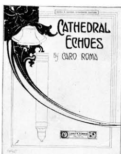
A beautiful "Chime" number by CARO ROMA