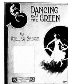
A characteristic Dance, very melodious, that will appeal to all lovers of light, catchy melodies. By ATELIER BEDOIS