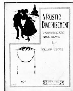
Characteristic Barn Dance by ATELIER BEDOIS

A collection of melodious Song and Instrumental numbers by famous composers. In this edition will be found compositions worthy of a place in the highest grade catalogues of the entire music world. Both songs and instrumental pieces will be a welcome edition to the repertoire of every music lover in the land. They are issued in an especially attractive manner, printed upon the best grade of paper and adorned with artistic frontis-pages.