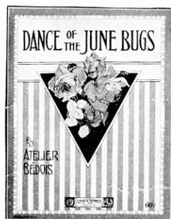
A bright, melodious, characteristic instrumental number of decided beauty. By ATELIER BEDOIS