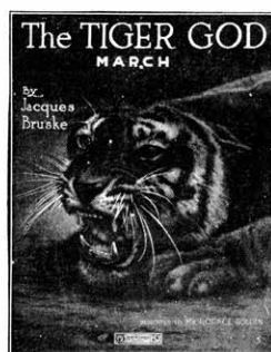
A stirring 4/4 March, filled to the brim with inspiring melodies. By JACQUES BRUSKE