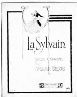
A beautiful Valse Caprice by ATELIER BEDOIS