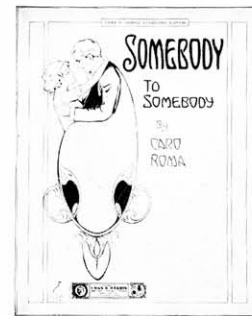
A Charming Ballad by CARO ROMA