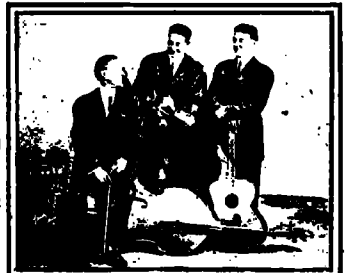
THE THREE WHITE KOBNS