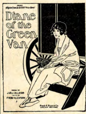
Adapted from $10,000 Prize Novel