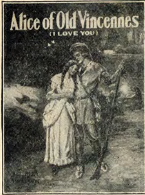
Another "Lonesome Pine"