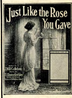
Ballad of Rare Beauty

Complete Copies on Sale Wherever Music is Sold!