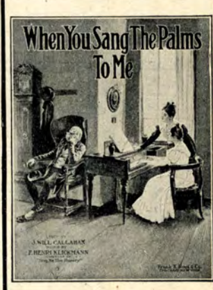
Appeals to Everybody