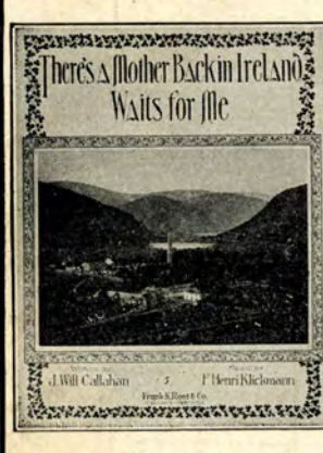
Beautiful Song—Appealing Words