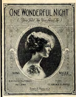
A Wonderful Waltz Song