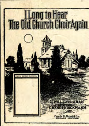
A Beautiful Home Ballad