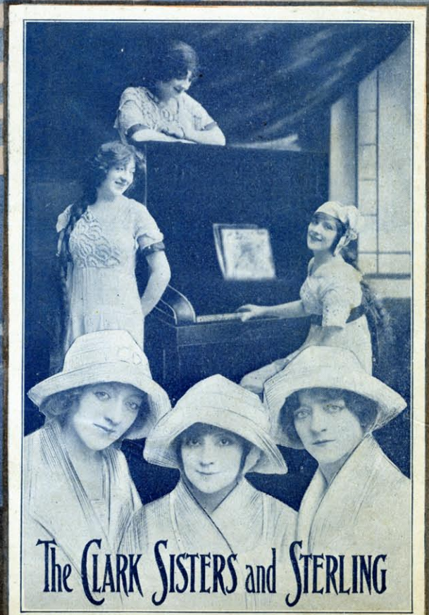
The CLARK SISTERS and STERLING