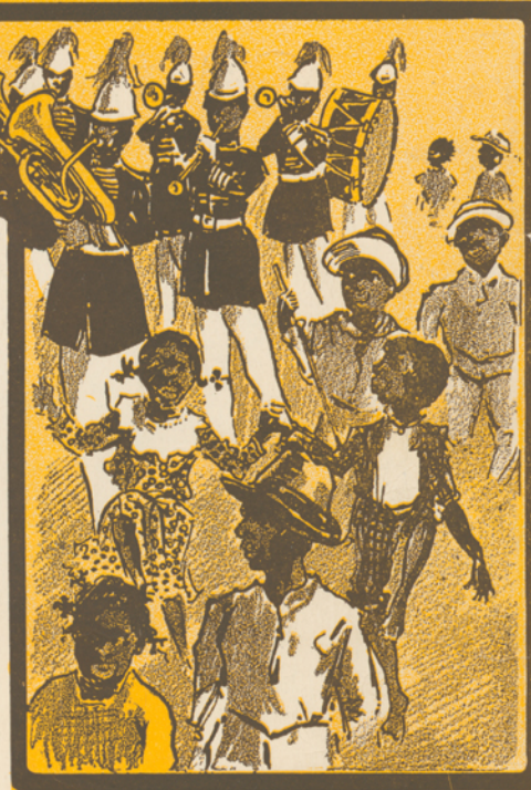
SONG & CHORUS