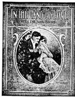
With Bird Obligato