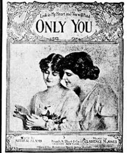
Waltz Song Hit