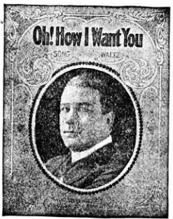
Great Waltz Ballad