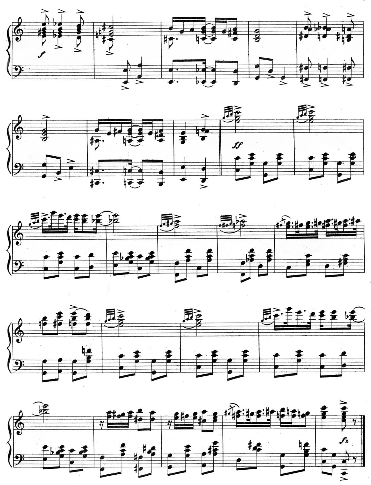
Spring-time Rag 4.